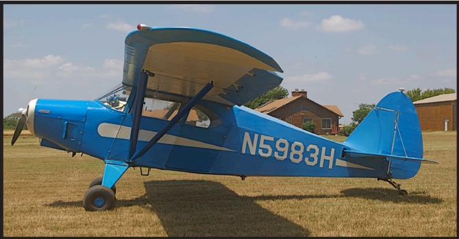
IMG_0435: N5983H, Piper PA-16, cn: 16-610, built 1949, owned by Michael McCormick