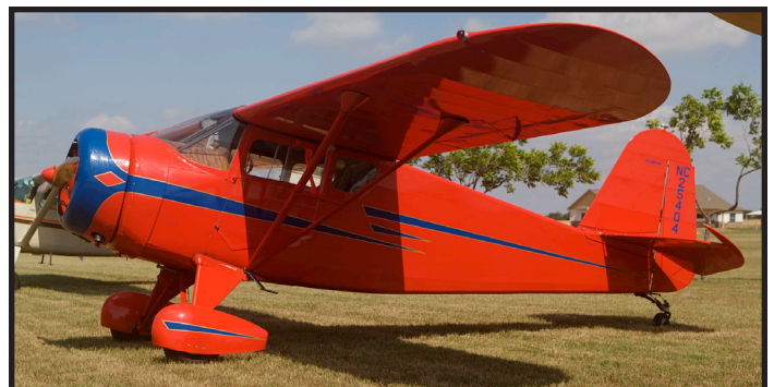
NC25404, Rearwin 8090, cn: 804, built 1939, recently rebuilt/restored by Don Pellegreno