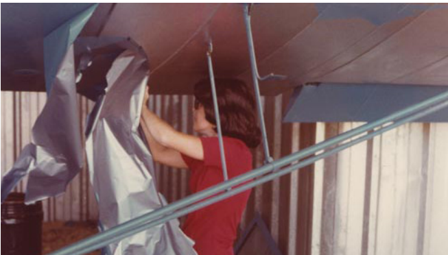
Can you identify these long time members?